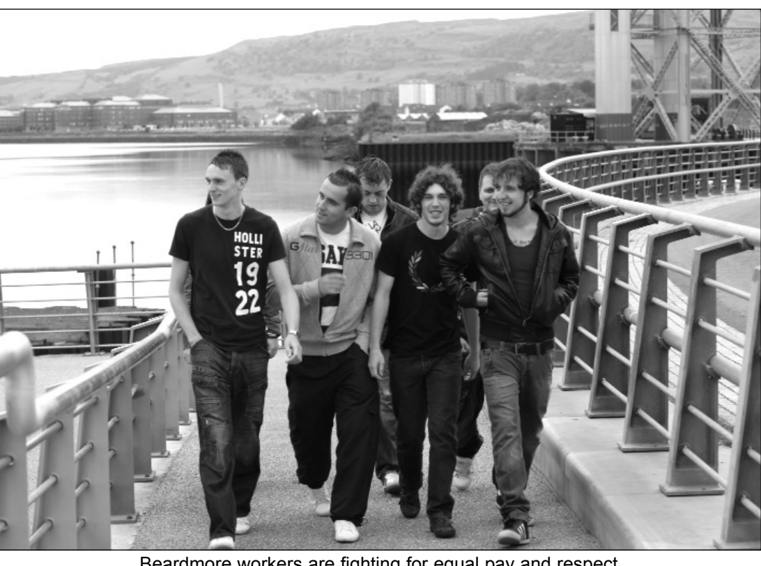
Beardmore workers are fighting for equal pay and respect

dispute over their employment status and rate of pay. Their employer disputes their claim that they are NHS workers and are entitled to the same pay as other NHS workers.