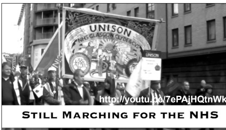
STILL MARCHING FOR THE NHS

The video reports on wins on the accrual of public holidays on maternity leave, getting 80% of domestics on Band 2, the 'pay as if at work' success when on annual leave, protection of flexibility payment for theatre staff at Golden Jubilee Hospital, and following a ballot, no reduction