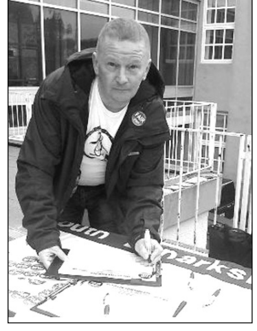
South Lanarkshire UNISON held a stall outside the Council HQ where 200 signatures were collected in just over an hour. Stewards in other workplaces also collected signatures. Over the next few weeks they plan to visit other workplaces to promote the campaign and collect signatures.