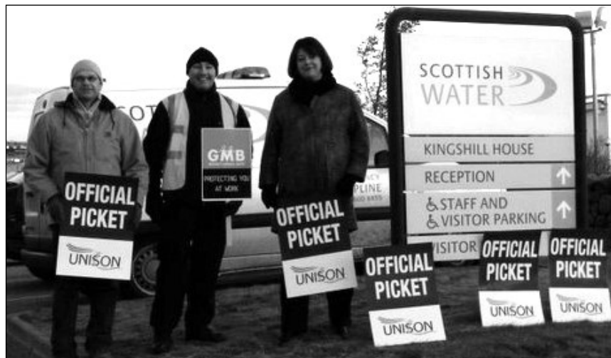
Early morning pickets in Aberdeen on 27 November

Pickets were out at plants and premises throughout Scotland, including sites such as Balmore Road in Glasgow, Fairmilehead in Edinburgh, Dumfries, Dundee, Aberdeen and throughout the Highlands and Islands.