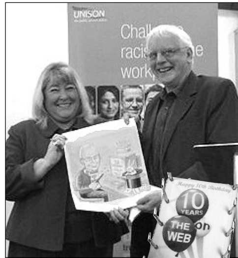
For more info, see www.unison-scotland.org.uk/10years