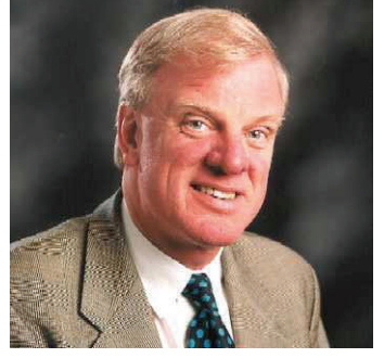
Edward Leigh MP. Tory Chair of the Commons Public Accounts Committee

"Government lacks accurate information on what corporate services cost and how they perform. There are no centrally agreed benchmarks against which to measure performance. The Cabinet Office doesn't even have a timetable for achieving this level of saving.