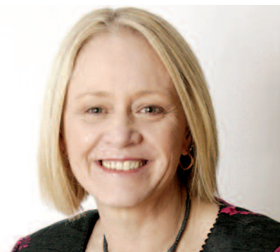
Cathy Jamieson MSP

Bill Butler MSP for Glasgow Anniesland) said “I believe that the bill will, as UNISON correctly pointed out in its evidence to the committee, lead to a sea change in the culture of NHS Boards. I believe