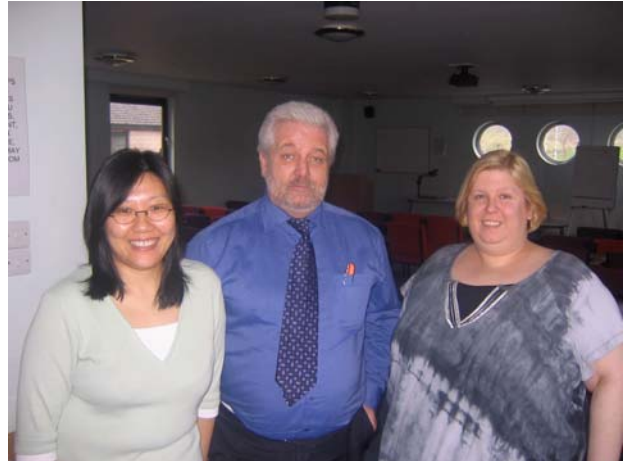
Information stall at Borders Health