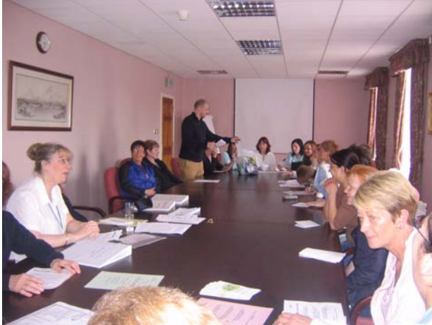
Information session at Forth Valley Health