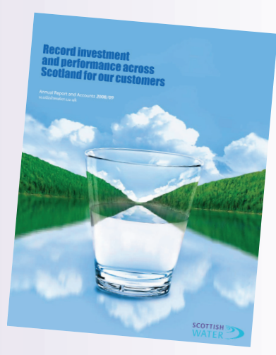
Annual report: In public hands Scottish Water is subject to public scrutiny

This does not mean that we should cling to the status quo. The water trades unions have published a paper 'It's Scotland's Water' that highlights other public service models that demonstrate that a more democratic structure can deliver a more efficient, socially responsible and more accountable public water service. There is a developing worldwide Water Network with the aim to strengthen the resistance against privatisation and commercialisation of water.