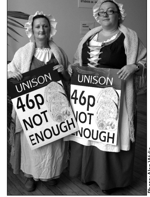
If they can beat the mill owners, look out CoSLA

Renfrewshire members make the link to the annual Sma' (Small) Shot Day festival which celebrates the historic victory of the weavers over the mill owners of 19th century Paisley.