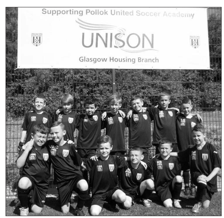
Glasgow Housing branch is pleased to sponsor Pollok United Soccer Academy. Just one example of branches supporting community initiatives.

"The tutors were extremely helpful and full of great ideas. I would recommend this course to anyone wanting to start up a branch magazine, newsletter or leaflets."