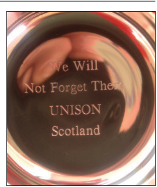
Presented to trade unions and NDOs by the delegation.

After a "harrowing but moving" visit to the Bhopal People's