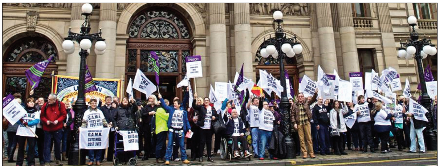
GAMH campaign: UNISON members, service users, community groups and the public lobbied Glasgow City Council on 12 November to warn 'cuts cost lives'.