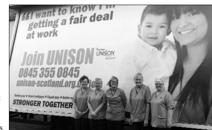
Domestic staff members at Chalmers Hospital, Banff

The Ayr/Prestwick bus has been sporting the UNISON advert, as has a bus shelter in Dumbarton.