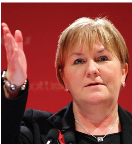
Johann Lamont MSP

Only then will we have a party that we can be proud of, that Scotland can be proud of.