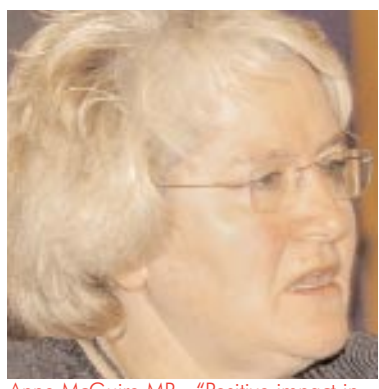
Anne McGuire MP - "Positive impact in Scotland"

Anne McGuire MP, Minister of State for Scotland, outlined