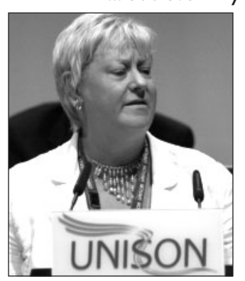
No Jane, the lights still work even if you shut your eyes.

... but even if you don't notice the light, there is