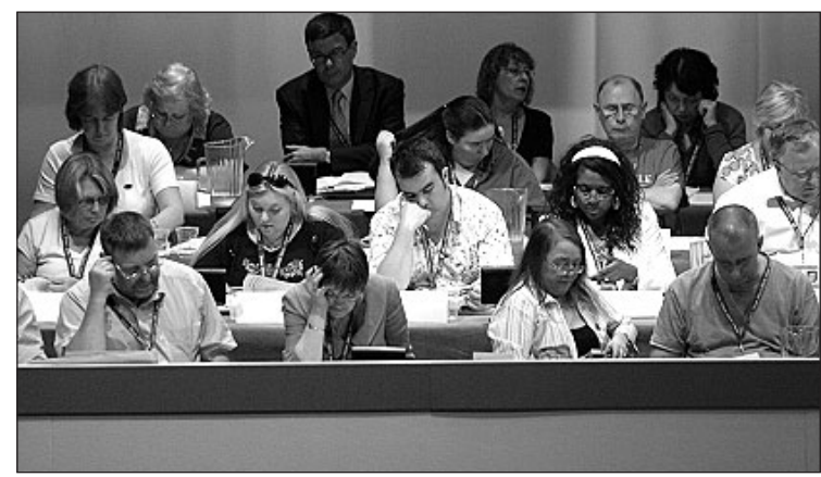
NEC members anxiously study the first UNISON Scotland briefing of the week.

Normally votes are taken by holding up bright coloured cards and the President will decide