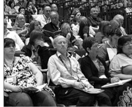
As you can see, some debates are totally rivetting

The Scottish Committee has supported the general direction of travel, and the specific