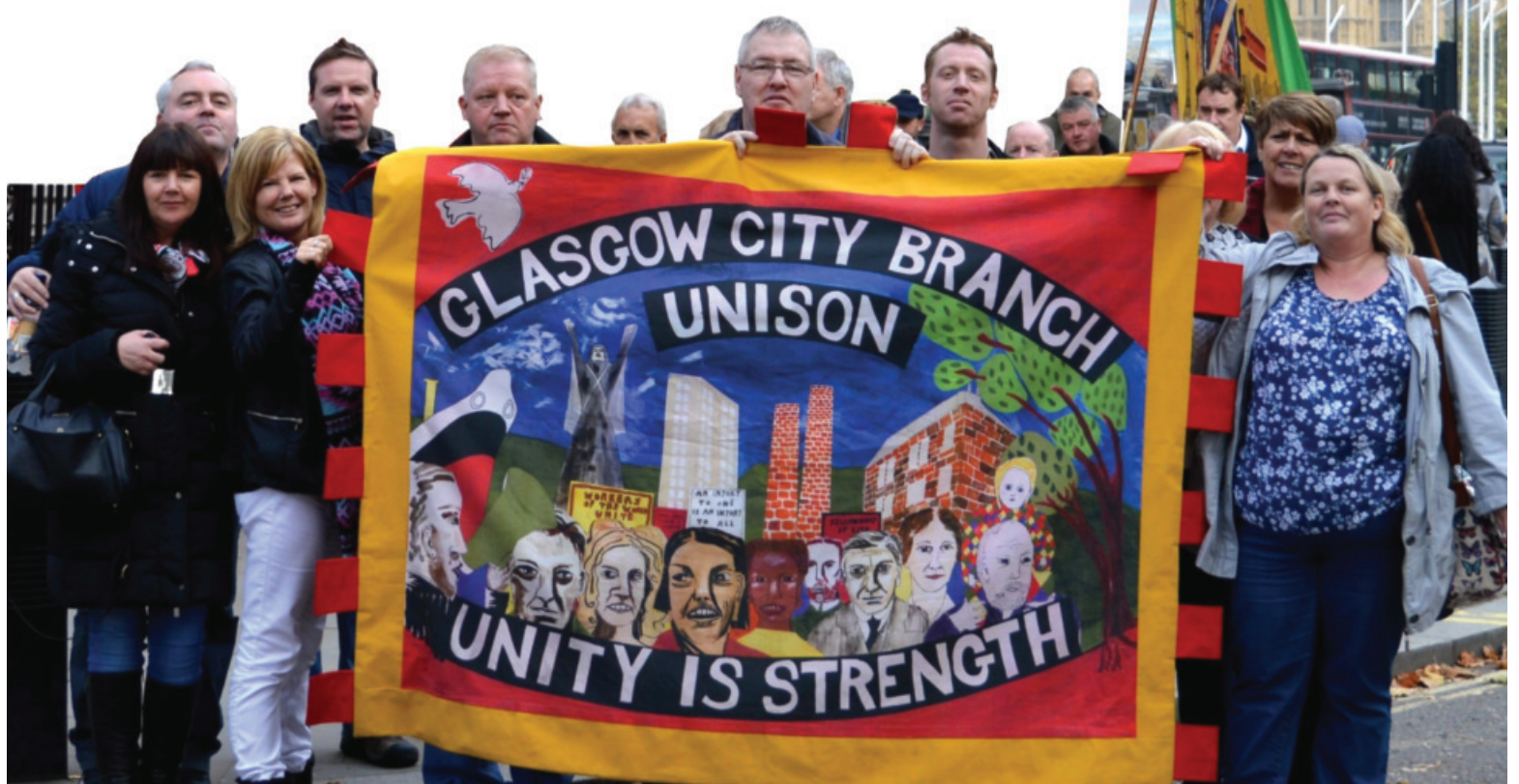
Glasgow City branch members were among the UNISON members from across Scotland who lobbied their MPs in London against the Trade Union Bill on 2 November. See more on Page 2

The bill is described by leading human rights groups as "a major attack on civil liberties in the