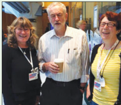
We thought the Aberdeenshire and City branch delegations got lost, but they found an MP to lobby!

The lobby started with a rally at Central Hall, Westminster. So full that hundreds were left outside.