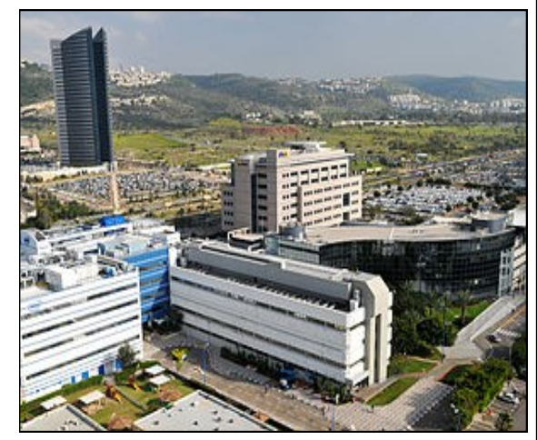
Elbit System headquarters in <u>Haifa</u>.

Whilst the Israeli technology known as 'NICE' is deployed in Scotland's biggest city; to justify this deployment the spokespersons for Glasgow City Council made three claims 1. NICE had no connection to the Israeli military. 2. The full capabilities of the