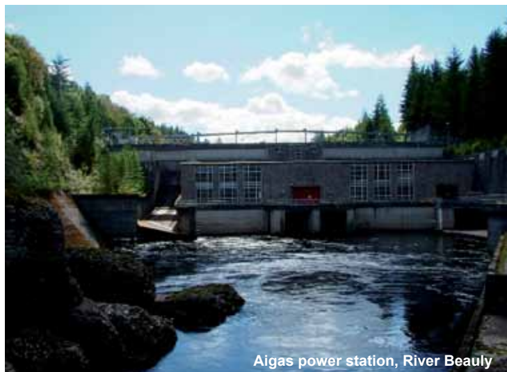
Aigas power station, River Beaully

In its first year, the Feed In Tariff scheme encouraged the development of 107.7 MWe of renewable energy capacity in the UK, 20% of which was in Scotland. Compared with the rest of the UK, Scotland has many more wind and hydro