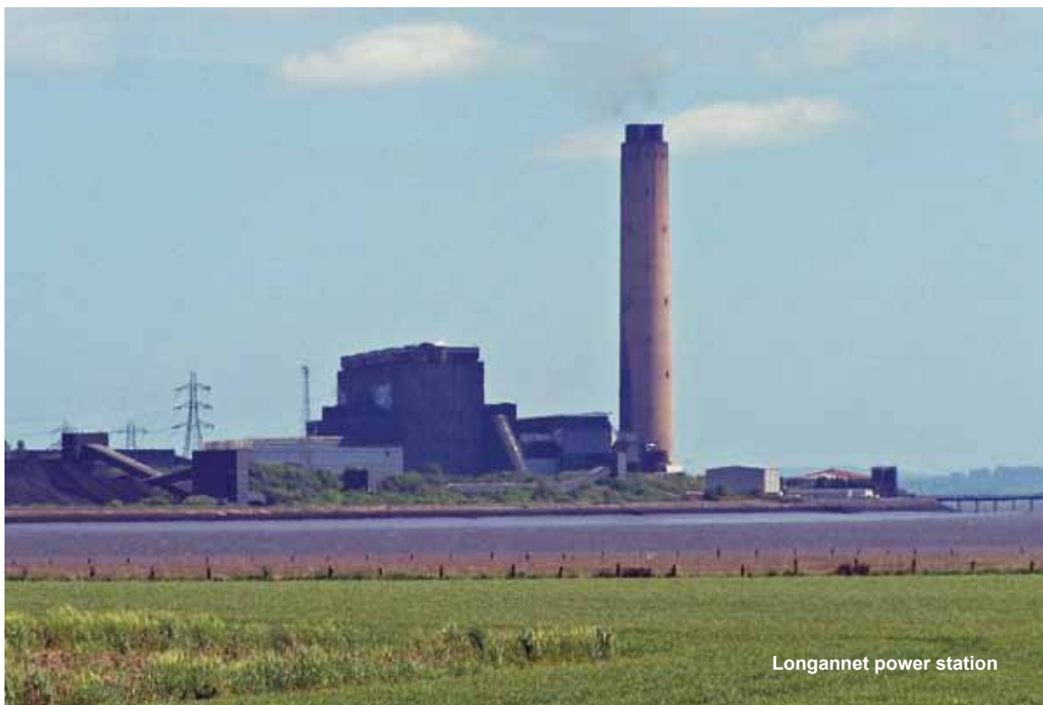
Longannet power station

Scotland is still rich in coal reserves and coal will continue to meet a significant proportion of future Scottish and global energy demand. Carbon capture and storage (CCS) has the potential to substantially reduce carbon dioxide (CO 2 ) emissions to atmosphere from large power plants. Both the UK and Scottish Governments have committed to maintaining coal as part of the energy mix in Scotland. Coal generation, primarily from Longannet, is the lynch pin of the Scottish